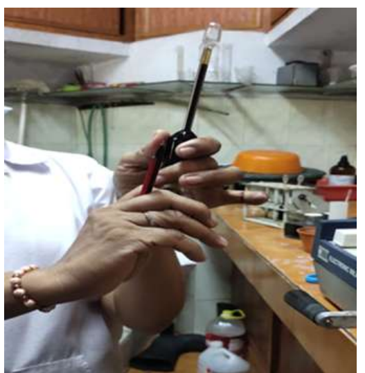
Figure 2. Butryometer