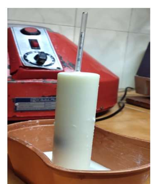
Figure 1. Lactometer

Standards Authority of India (FSSAJ), 2011, over 68 % of milk in India is found adulterated. The most common adulterants found in milk are detergents, caustic soda, white paint, refined oil and glucose. In rural areas of India, 8-13% of milk is adulterated mainly with water.